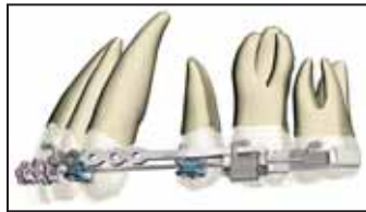
504 Differential Friction

Various contemporary mini-screws are depicted on this month's cover. (See p. 527 for a list of manufacturers.)