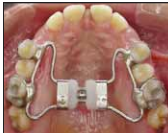
528 Expansion Capacity